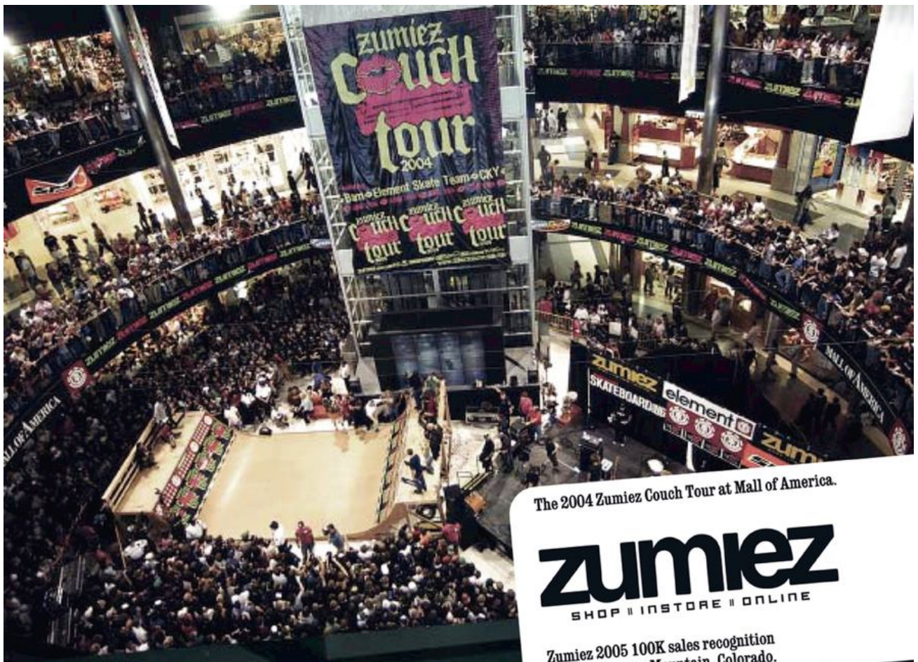
The 2004 Zumiez Couch Tour at Mall of America.