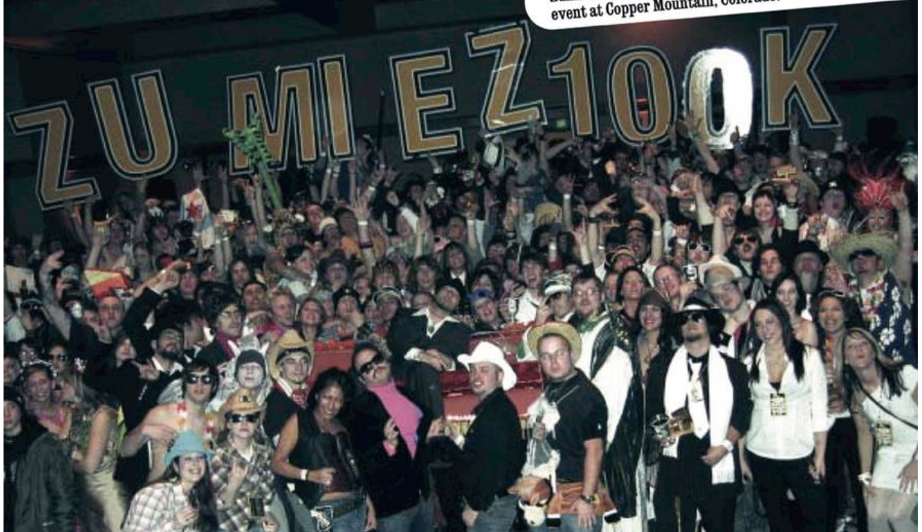
Zumiez 2005 100K sales recognition event at Copper Mountain, Colorado.